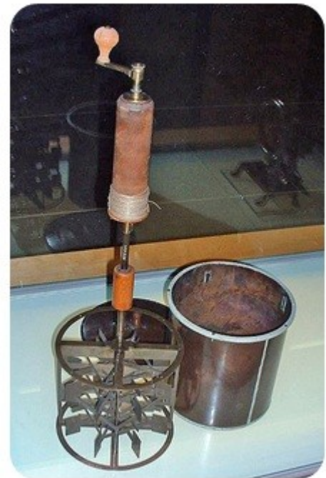
Joule's heat device